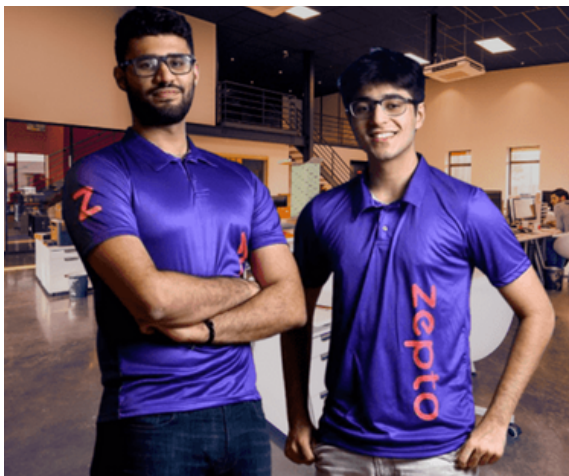
The founders of Zepto